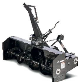
3 pt. snowblower