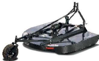
3 pt. rotary cutter