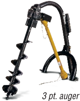
3 pt. auger