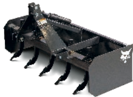
3 pt. box blade