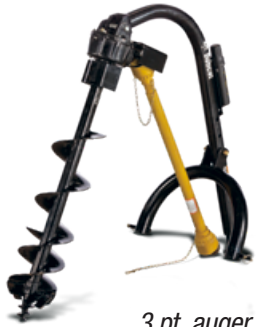
3 pt. auger