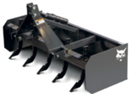
3 pt. box blade