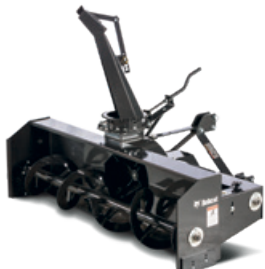
3 pt. snowblower