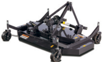
3 pt. finish mower