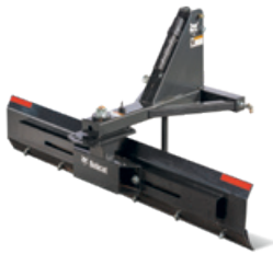
3 pt. angle blade