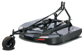
3 pt. rotary cutter