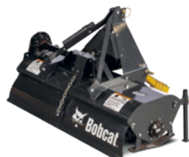
3 pt. tiller