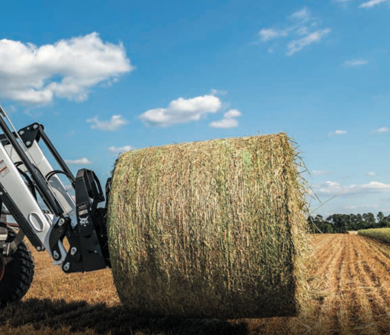
Machine: UT6573 Attachment: Bale Spear Implement: 3 pt. Bale Spear