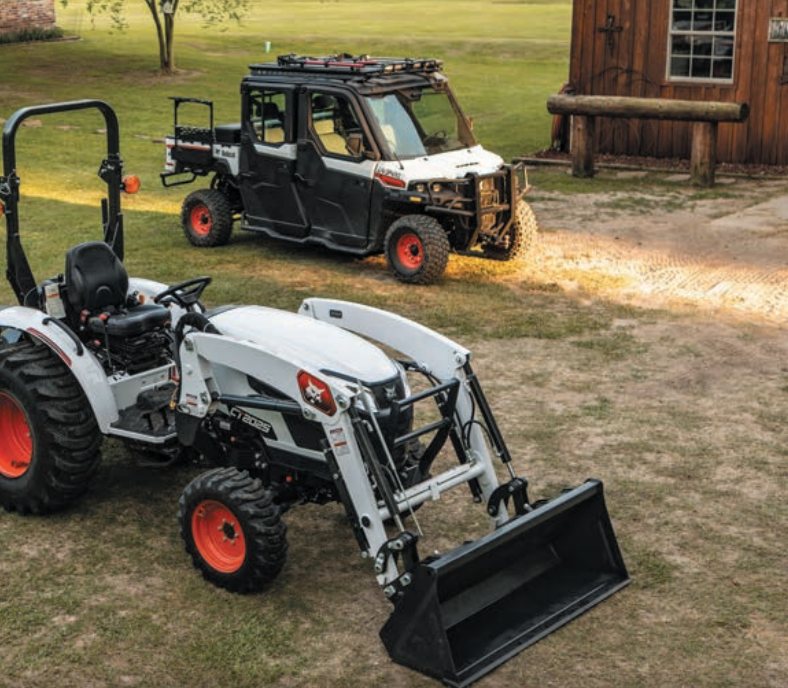
Machines: ZT6000, UW56, CT2025, UV34XL