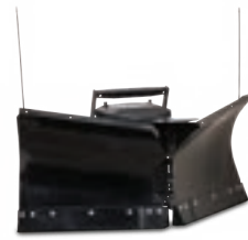
Pictured: Heavy-Duty V-Blade