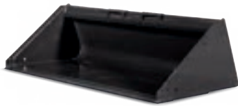
Pictured: Heavy-Duty Bucket