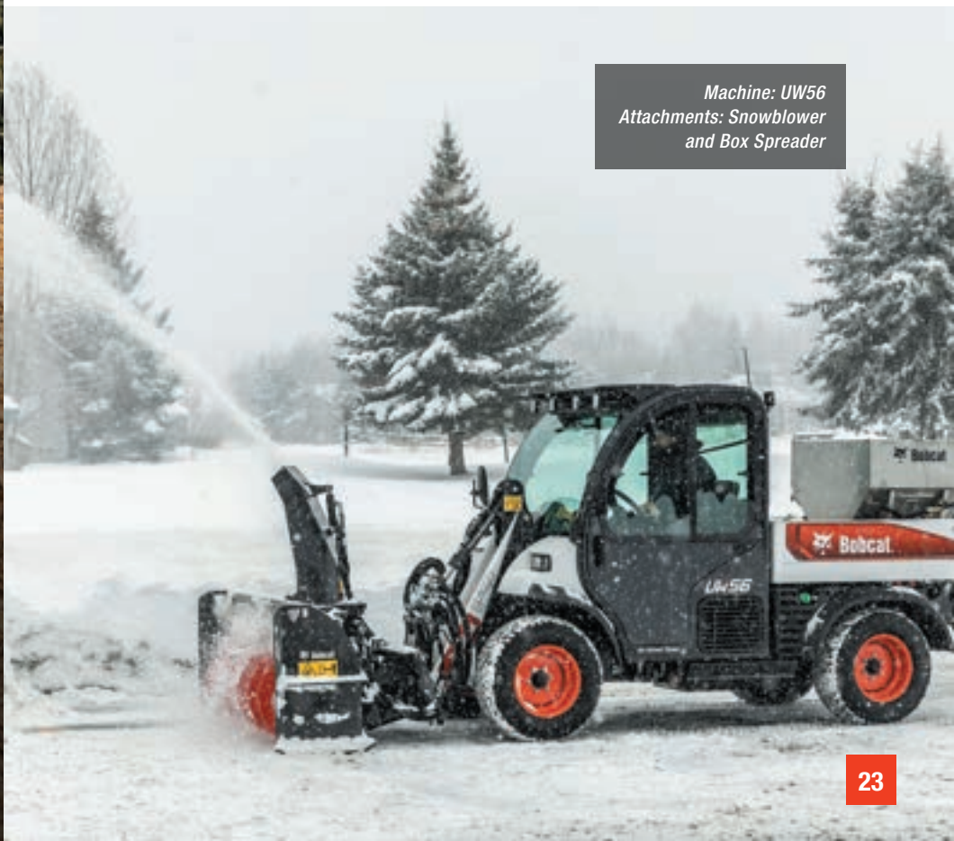
Machine: UW56 Attachments: Snowblower and Box Spreader

SEE PAGES 36-43 FOR MORE INFORMATION ABOUT BOBCAT ATTACHMENTS AND IMPLEMENTS.