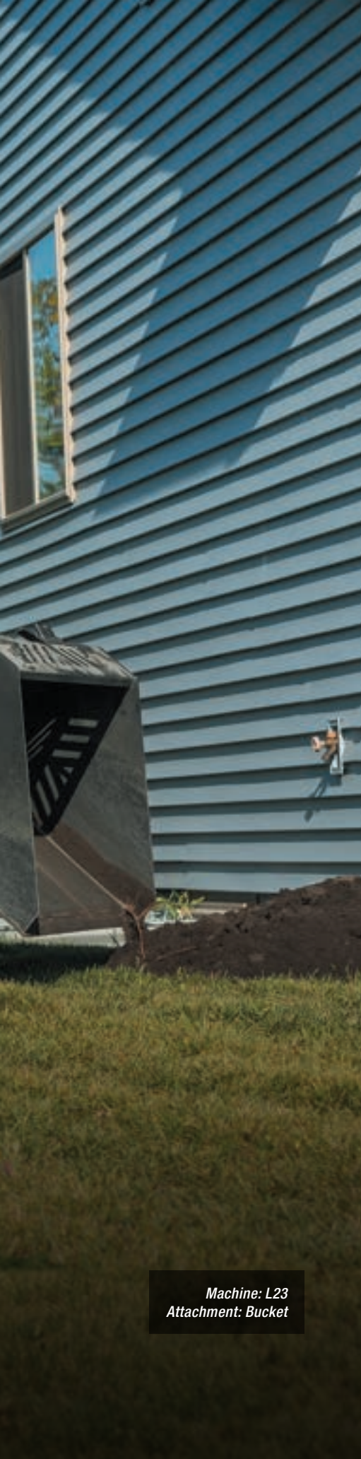
Machine: L23 Attachment: Bucket