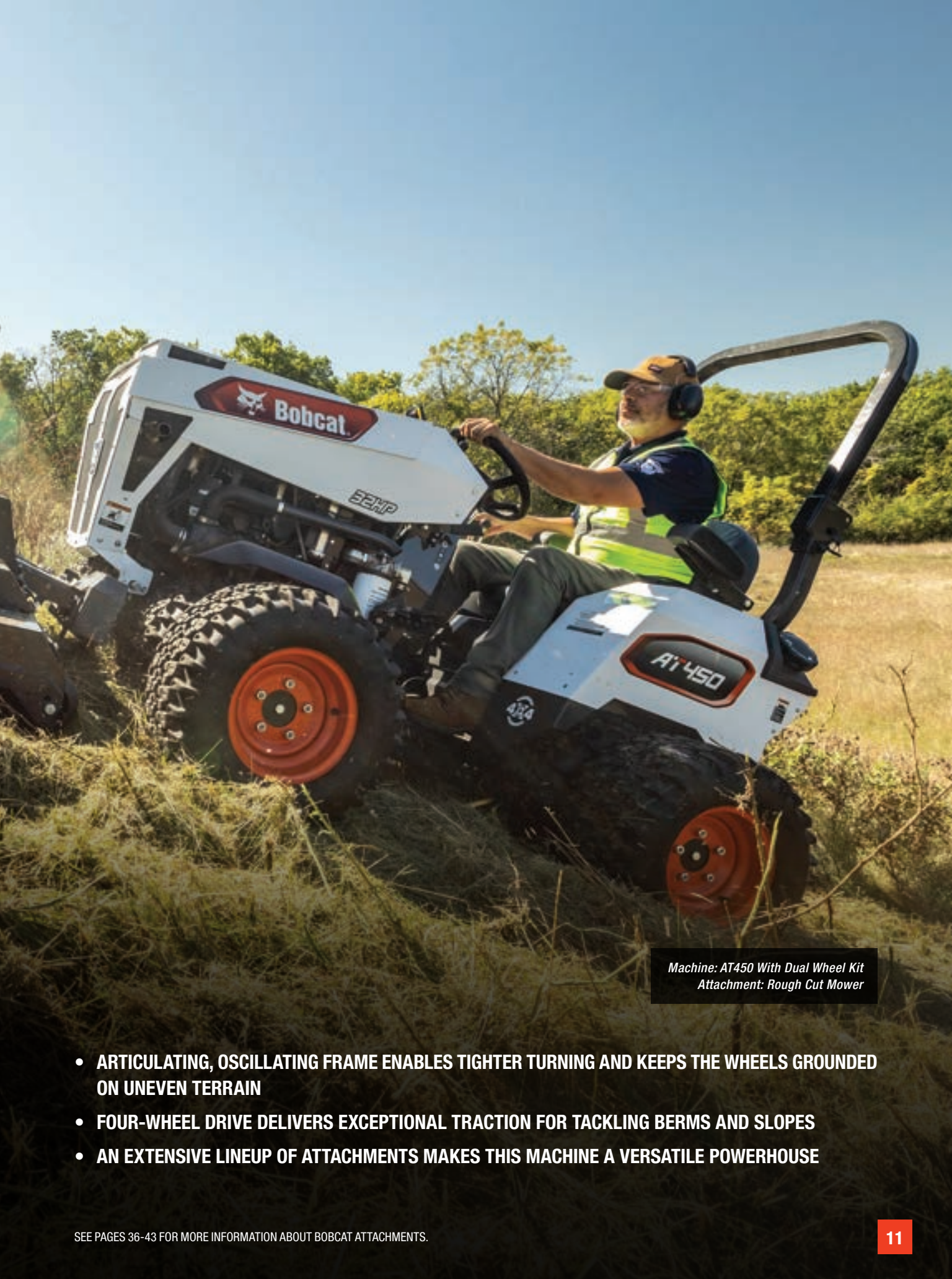
Machine: AT450 With Dual Wheel Kit Attachment: Rough Cut Mower