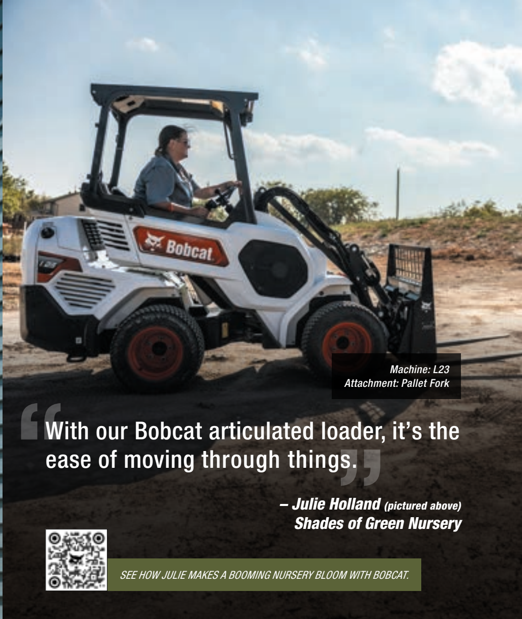
Machine: L23 Attachment: Pallet Fork

“With our Bobcat articulated loader, it’s the ease of moving through things.”