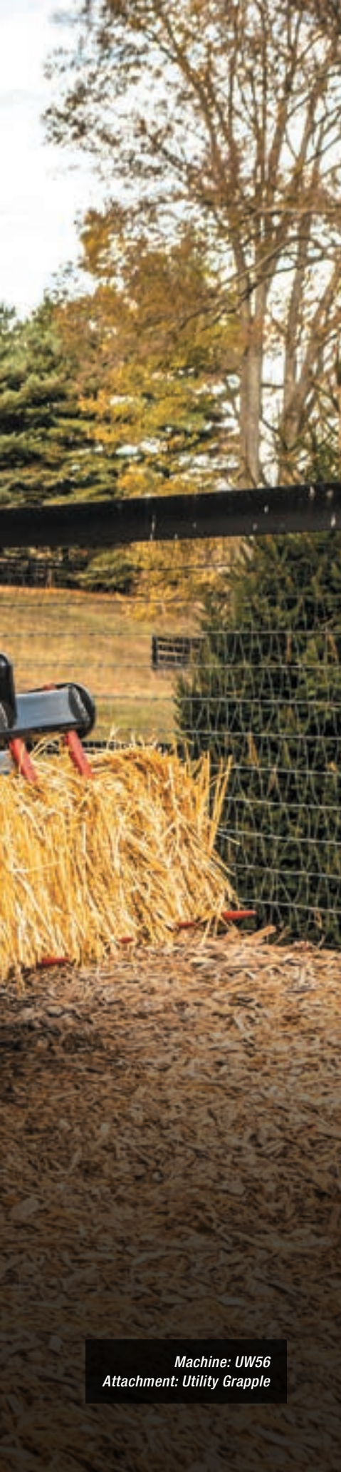
Machine: UW56 Attachment: Utility Grapple